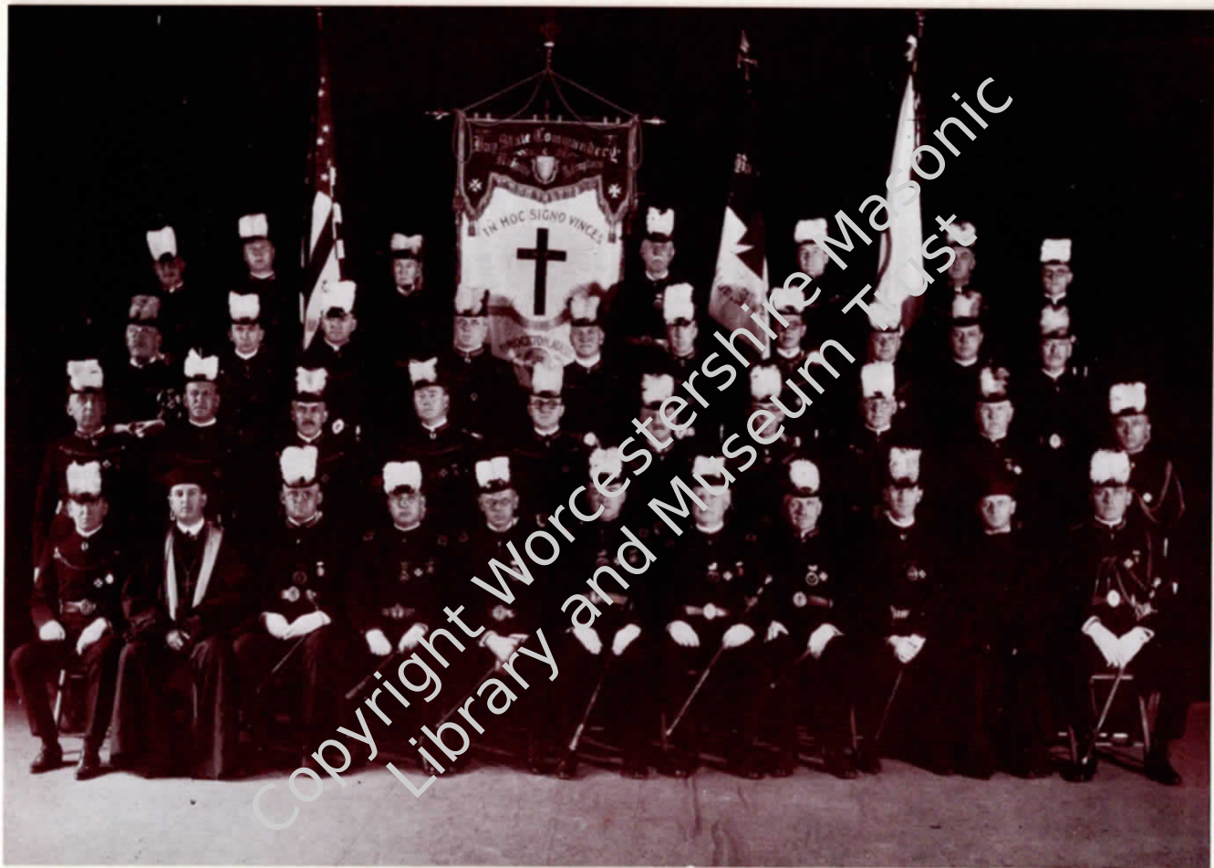
OFFICERS AND GUARDS, BAY STATE COMMANDERY 1922 — 1923